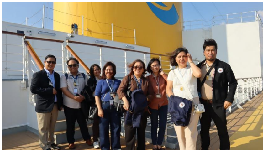
DMW representatives had the opportunity to witness the working environment of Filipino seafarers onboard Costa Serena