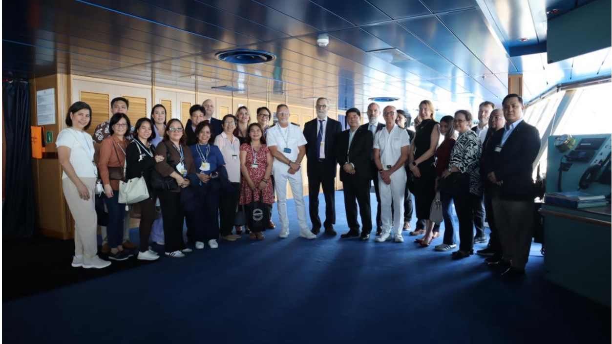
Costa Serena ship management welcomed the delegation from the Italian Embassy, Department of Migrant Workers (DMW), VFS Global, and Magsaysay Maritime Corporation